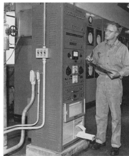
Gas Chromatography in Process Control