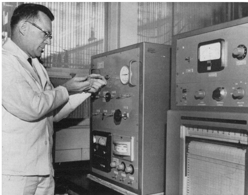
Gas Chromatography in Research